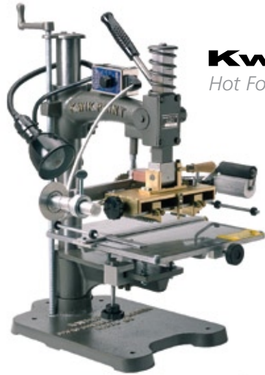
Kwikprint™ Hot Foil Printing System