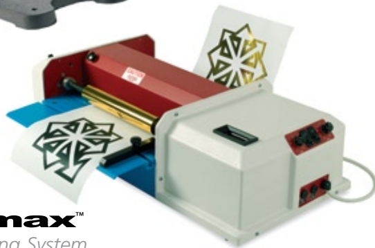
Foilmax™ Toner Foiling System