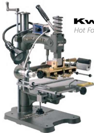
Kwikprint™ Hot Foil Printing System