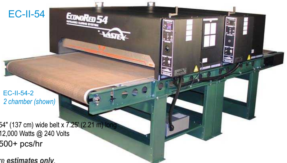
EC-II-54-2 2 chamber (shown)

54" (137 cm) wide belt x 7.25' (2.21 m) long 12,000 Watts @ 240 Volts 500+ pcs/hr